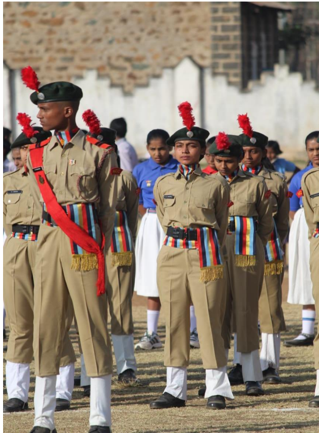
NCC cadets at Taluka parade ground