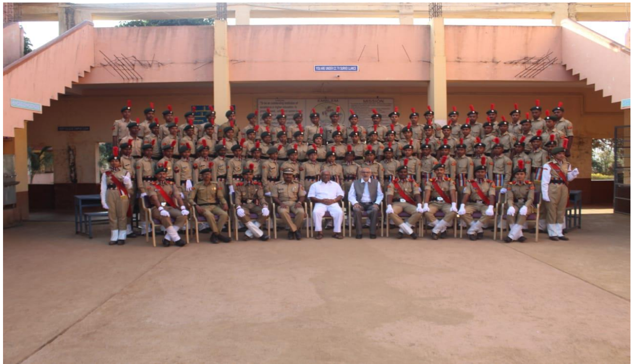
NCC cadets group photo