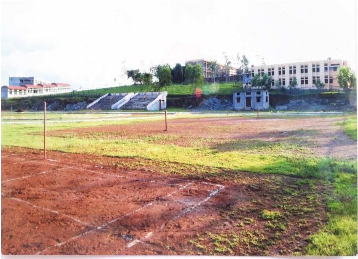
Ply ground of our college