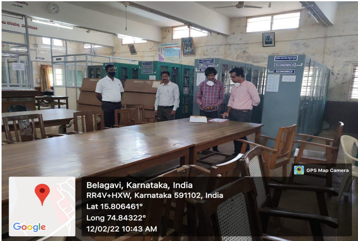
Library of our College

[Signature] PRINCIPAL, K. R. C. E. Society's, G. G. D. Arts, B. M. P. Commerce & S. V. S. Science College, BAILHONGAL.