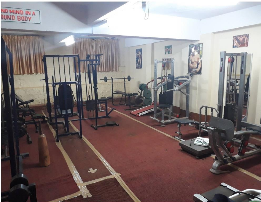
Six Station Multi-gym