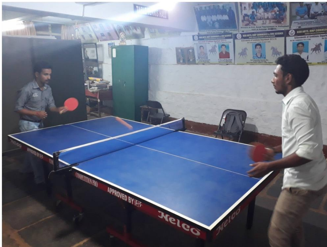
Table Tennis Court