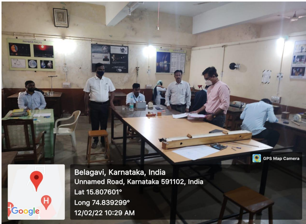
Department of Physics