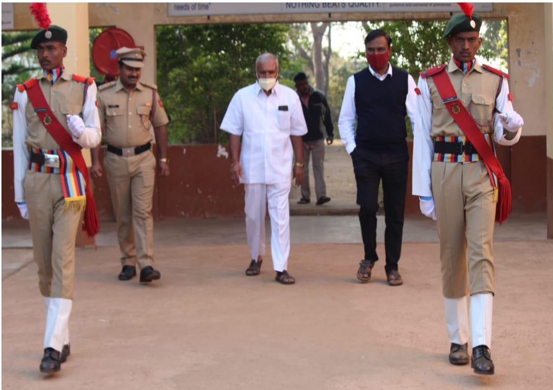
Slow march/Piloting by NCC cadets.