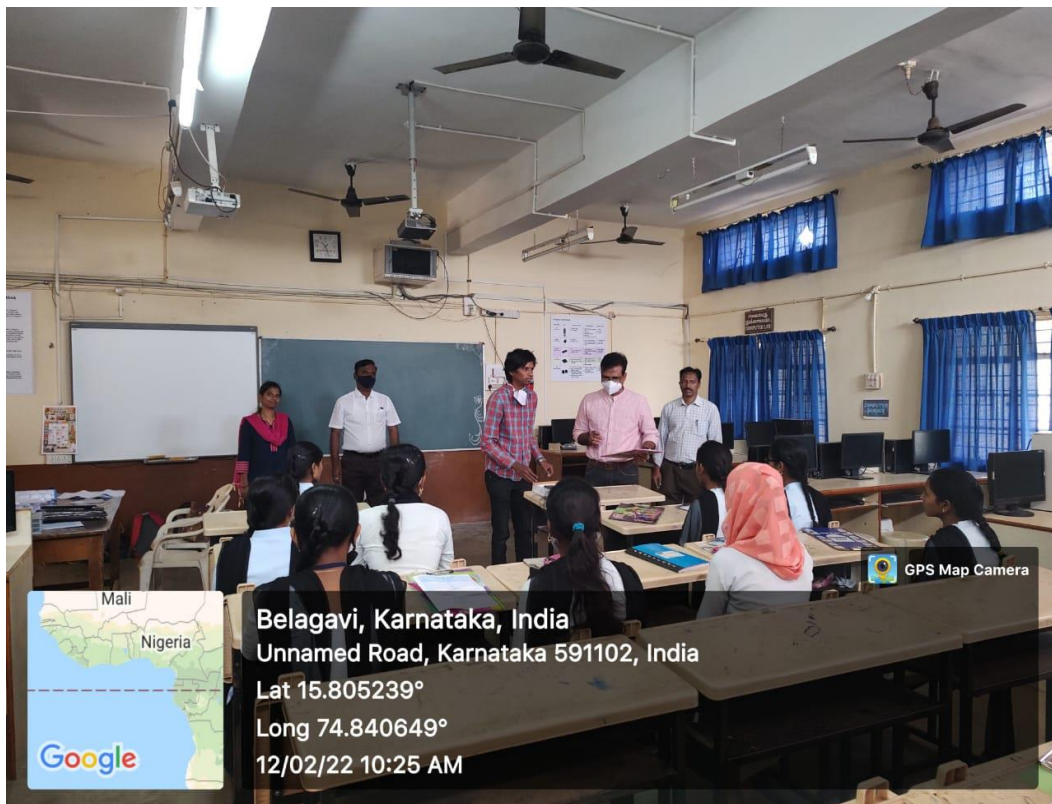
Department of Computer Science