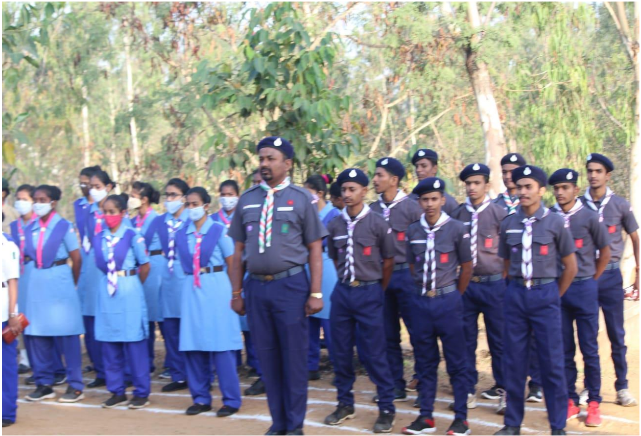
Bharath Scouts and Guides volunteers.