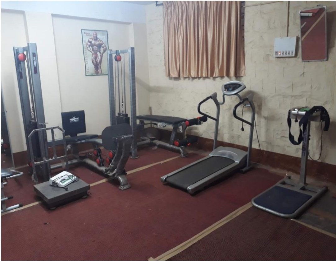
Six Station Multi-gym